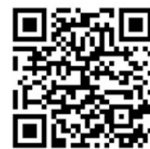
Campaña Anual del Obispo | Diocese of Raleigh dioceseofraleigh.org