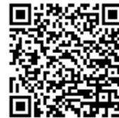
Bishop's Annual Appeal: Donate Online | Diocese o... dioceseofraleigh.org

This week, we begin the 2024 Bishop's Annual Appeal. The Bishop's Annual Appeal is our opportunity as members of the larger Catholic community to have an impact on the physical and spiritual lives of our brothers and sisters in Eastern NC. We are celebrating 100 years of our Diocese: Learning from our History and Shaping our Future. Please visit givetobaa.org and help us make a difference. Our goal has been set at $121,539.37